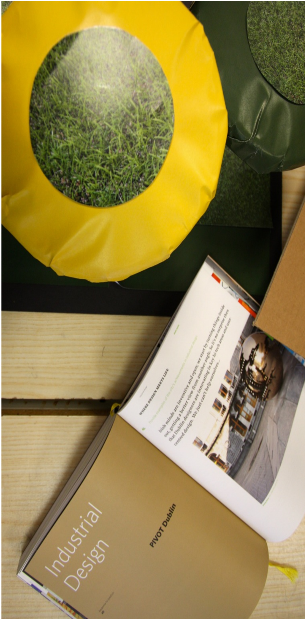
Shrooms with Pivot Dublin Bid Book